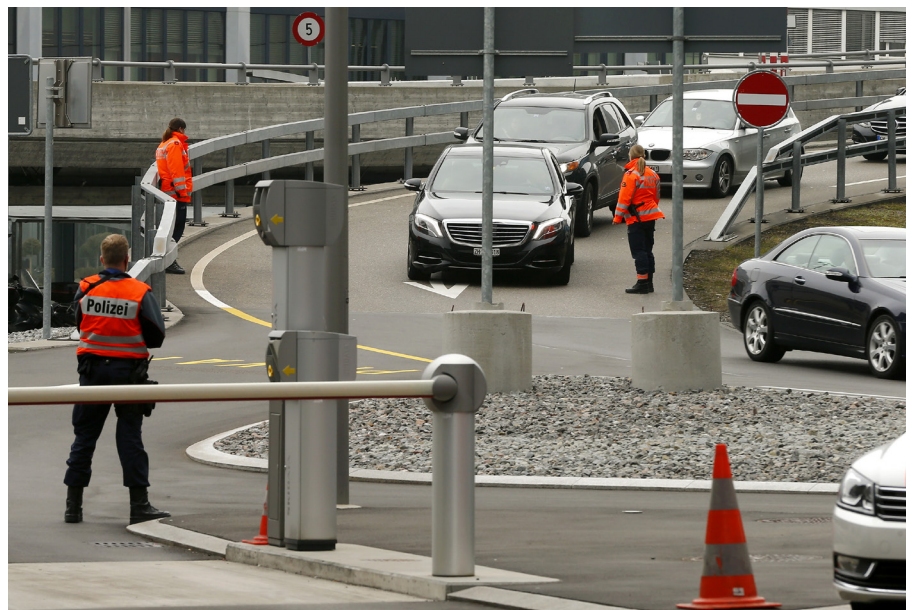
Shortly after the attacks on Brussels airport in March 2016, at Zurich Airport, too, police presence and security checks were increased.

Modern airports are complex entities with many different functions. Besides the controlled access to gates and aircraft, called